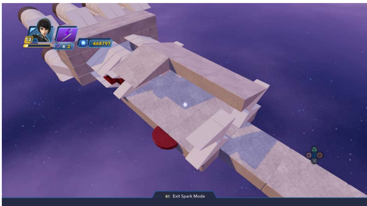
Slant Terrain For The Ship Roof